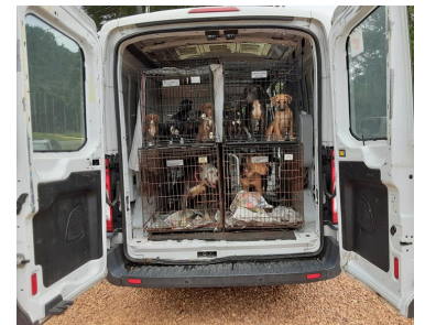
Scores of national and local adoption partners are working with us to transport homeless storm victims to no-kill shelters around the country.