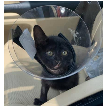
This little kitten was severely injured during the hurricane and required a leg amputation.

The Humane Society of Louisiana has been working tirelessly to aid the animal victims of Hurricane Ida. Even before the storm made impact, when the hurricane first took deadly aim at Louisiana, we initiated multiple rescue missions to save homeless shelter animals in harm's way. At the same time, our New Orleans team and 17 animals evacuated north to our Merry Wood Refuge, which is two and a half hours north of the city. Even at this more inland location, the powerful storm felled huge trees and knocked out power at the refuge, as well as at our nearby Enoch J. Donaldson Animal Sanctuary and Animal Transport Center . Luckily, despite damage to outer buildings and many downed trees, all of our crew members and animals were safe. Immediately after the storm, we began a difficult disaster response in extremely harsh conditions. In the relentless heat - with no electricity and with fuel, food and supplies scarce - we worked tirelessly to save the storm's animal victims. Our team worked around the clock to organize transports, rush supplies around the state and respond to emergencies. From managing and distributing huge donations of relief supplies, to providing emergency veterinary care for injured animals, our expanded programs will be urgently needed for some time, as local people and animals struggle yet again to recover from disaster.