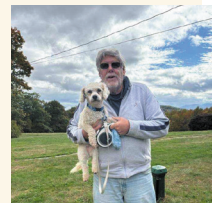
Leo (above) was adopted this month!

Lil Girl (left) was suffering with a severely injured eye that required removal. Her elderly owners, unable to afford the necessary procedure, reached out in desperate need. Thanks to the generosity of our Emergency Fund donors, Lil Girl received the urgent care she needed. Her family is overjoyed and immensely grateful for the support.