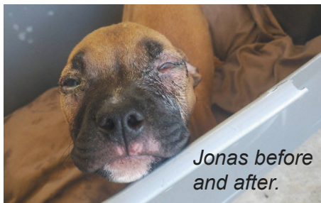
Jonas before and after.